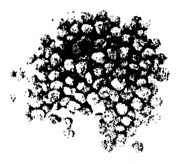
Plate 3 Dry Samples of Brown Tiger Nuts