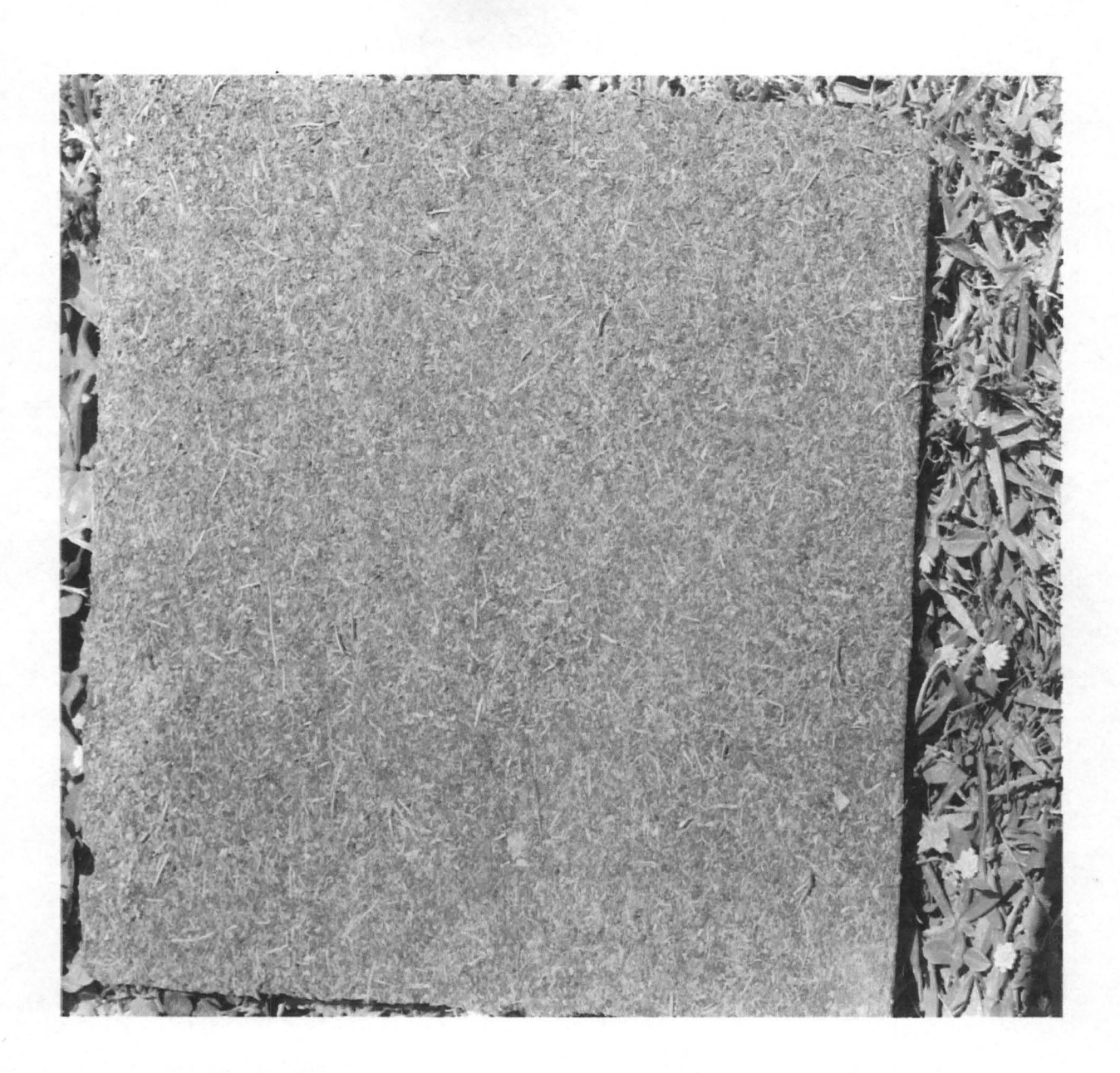
Plate 1 : Developed Particle Board.