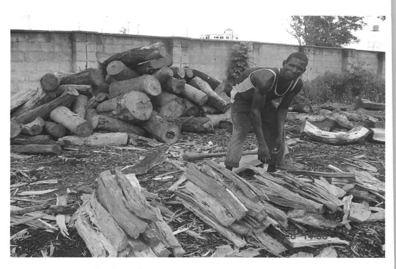
Plate II. A retailer selling in small portion to immediate consumer(s).

opportunity to people to engage in large scale commercial fuelwood business, thereby gaining full occupation in the destruction of the trees as indicated in Plate II.