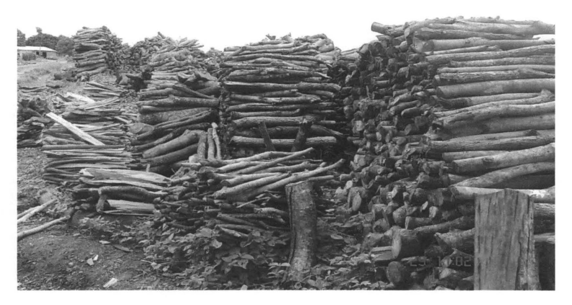
Plate I. One collection point of fuelwood extracted from the bush.

increase thereby impeding on the afforestation programme of the government. Plate I clearly show one of the several collection points of fuelwood extracted from the bush, most likely from one of the government afforestation programme site.