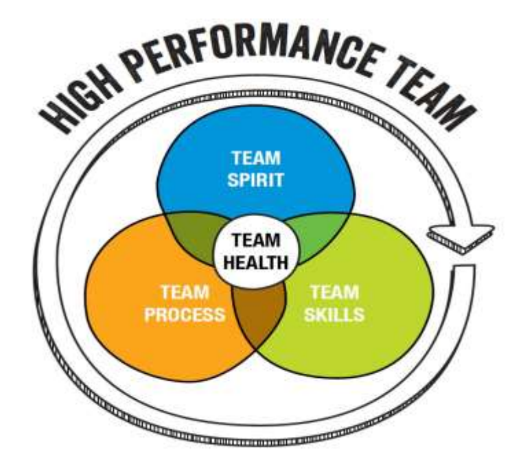
Figure 2.3: High performance Team Model

When you combine the individual and teams needs that's when performance takes on. You'll really start driving your team towards success and achieve outstanding results as a leader.