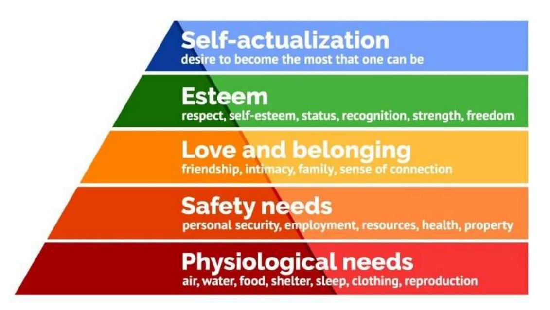
Figure 2.2: Maslow's Theory of Motivation

When building elite teams we focus on making sure all these elements are met individually and people become the best they can be. We do that by making sure the key elements for team success are in place too.