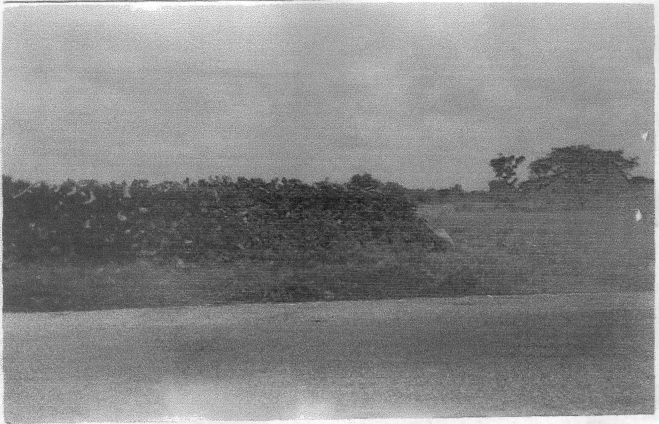
Plate 3: Rural Women involved greatly in deforestation, these are heaps of firewood arranged for sale. Mostly the urban people come to buy for their domestic use.