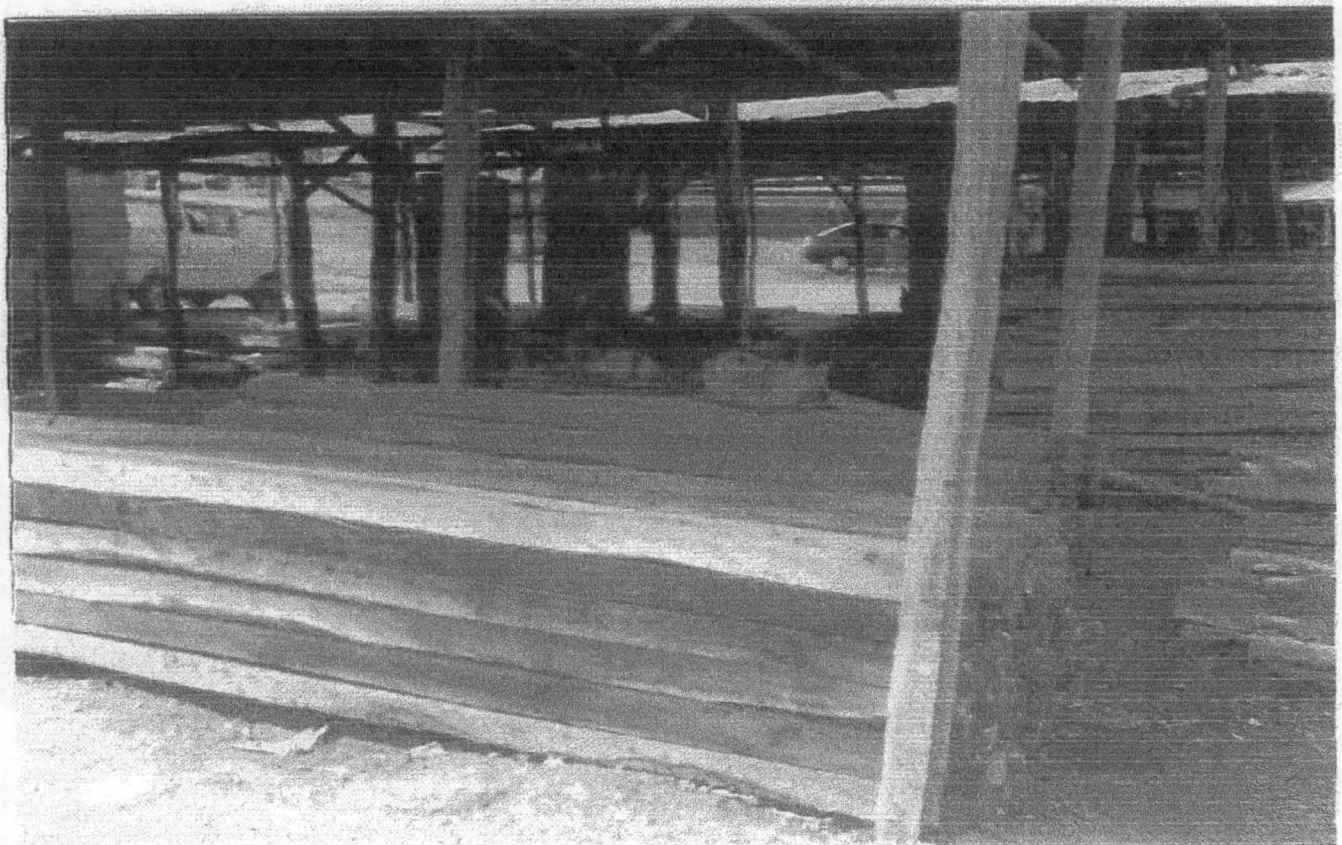
Plate 8: Timber brought from the bush into the timber shed ready for sale to end users either for roofing of house, constructions of furniture etc.