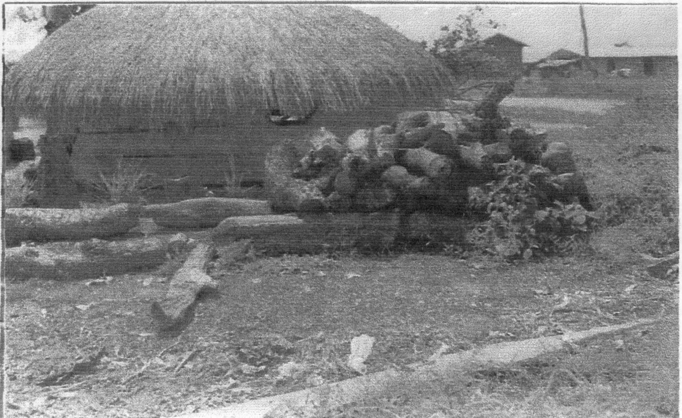
Plate 4: Women contribute greatly in deforestation as it is a pride for a gwari women pack heaps of wood at the backyards of the house.