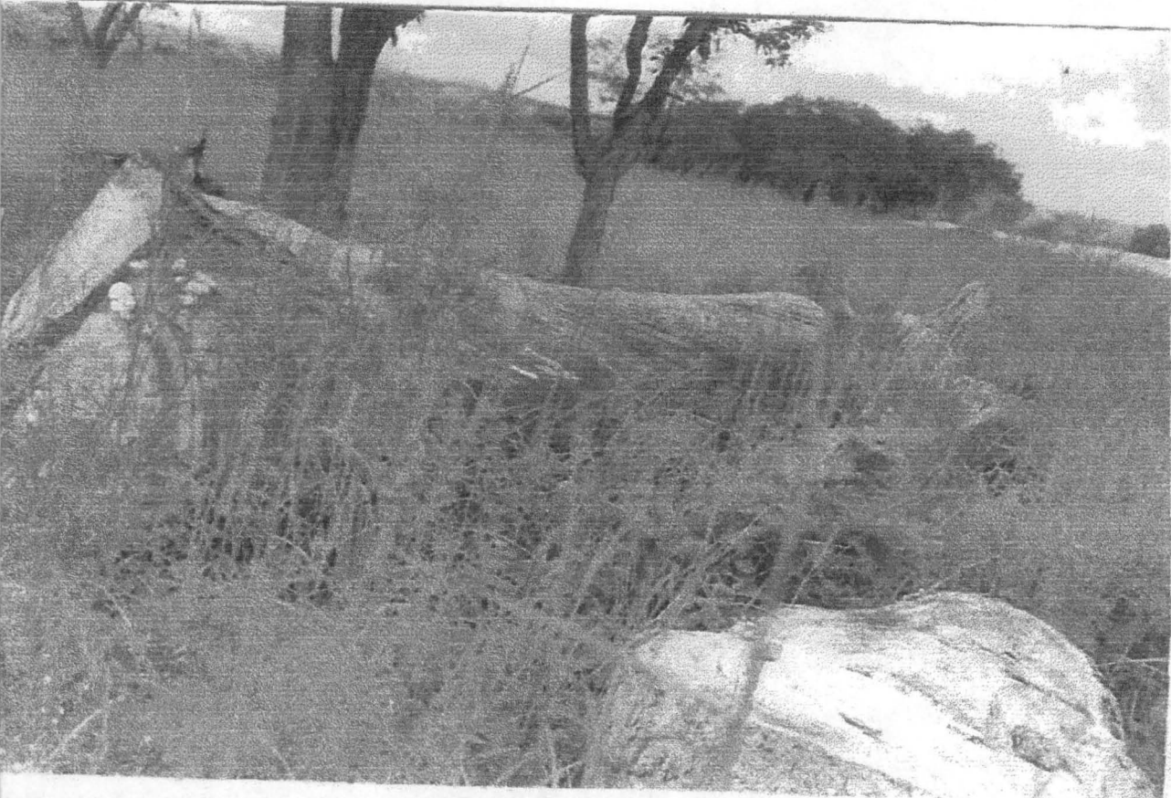
Plate 6: A log of timber felled, it is ready for cutting into pieces of 4 x 6 x 12 and 3 x 9 x 12 after that it will be loaded into 911 lorry for transportation to timber shed as it is shown in plate 7 below. These are all processes of deforestation.