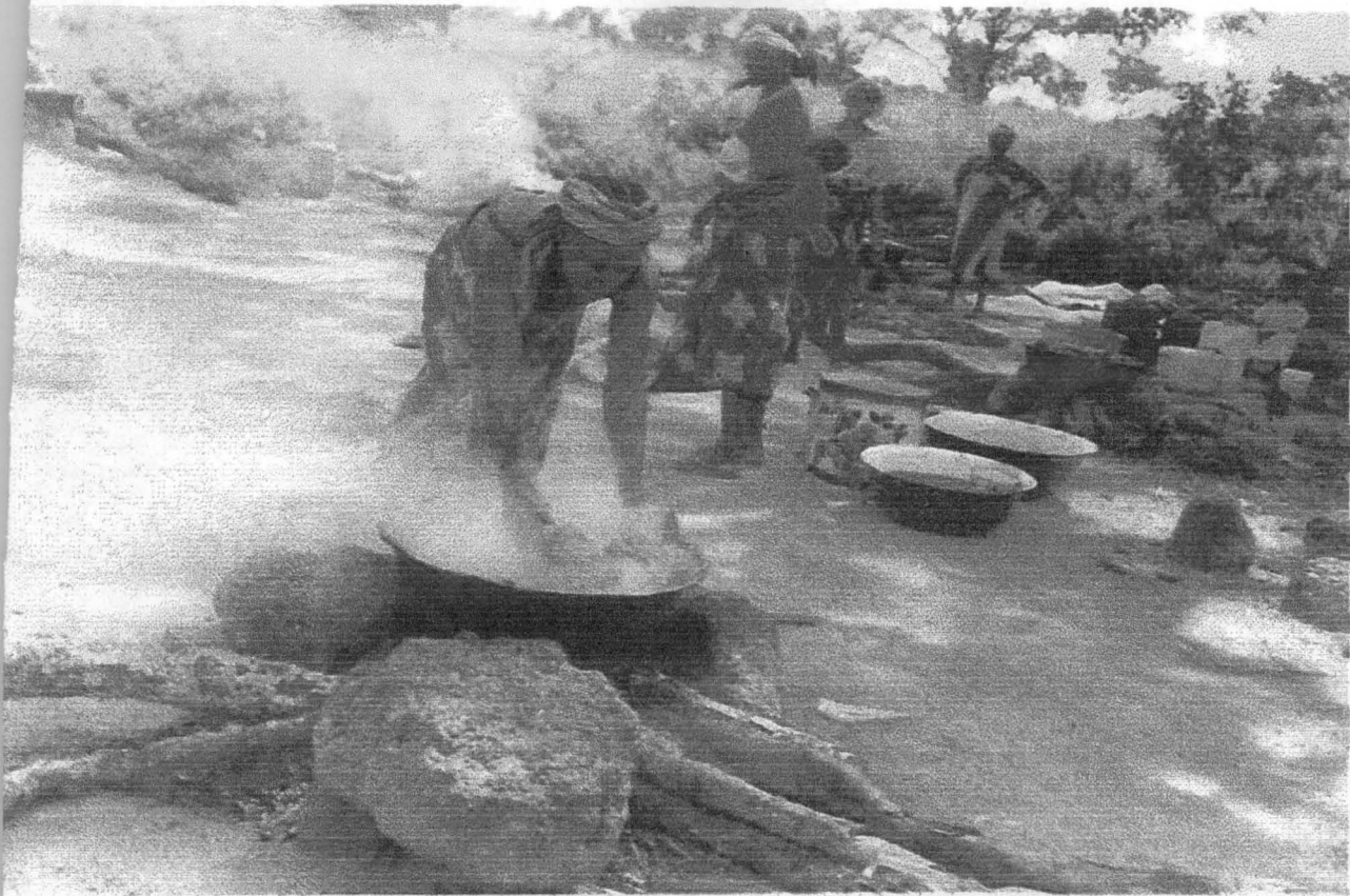
Plate 5: The Gwadara Women used the ashes derived from firewood used in preparing Black soap known as sapolo solo