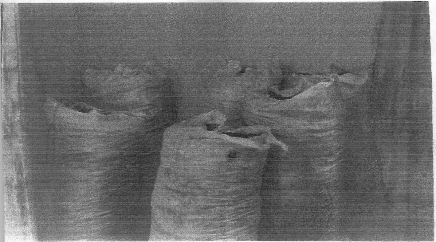
Plate 1: Charcoal production is one of the source of income by mada Women. It is packed into the sacks ready for Transportation to the Market. It is one of the factors involve in deforestation.