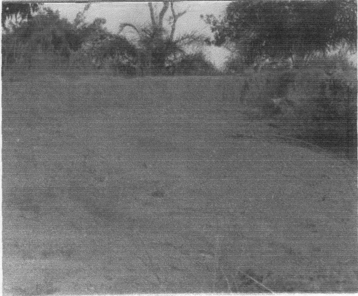
PLATE 11: Road construction is one of the factor involved in deforestation and land degradation in the process of clearing land to get good soil, the bulldozer removed the vegetation cover and the top soil leaving the soil infertile, there will be runoff, the land is left without vegetation, hardly will grass grow in the area, the above pictures is a typical example.