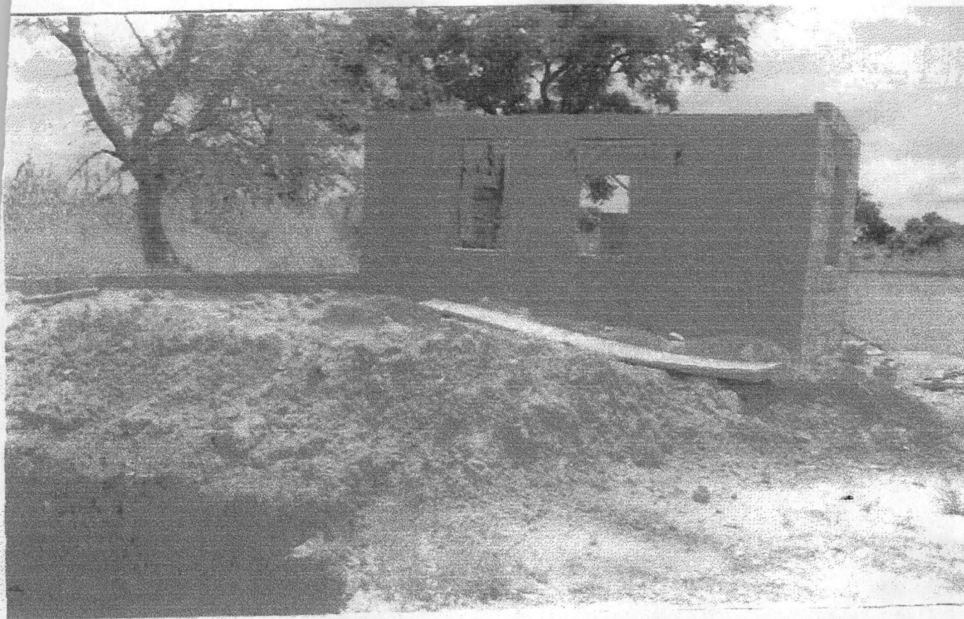
Plate 9: Influx of people into the town involved in deforestation, an example of the above picture shows construction or building of a house.