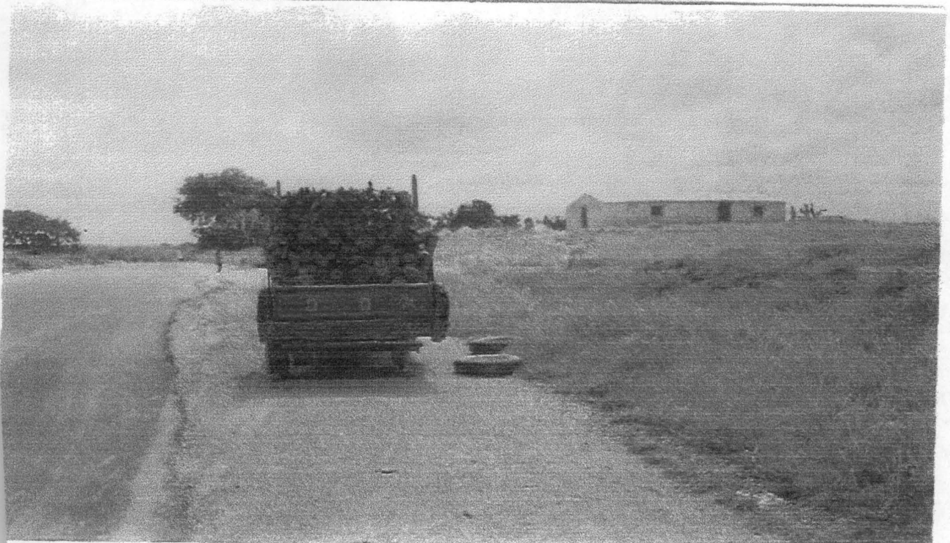
te 2: Firewood inside the Pickup on the way to the urban city for sale - source of deforestation.