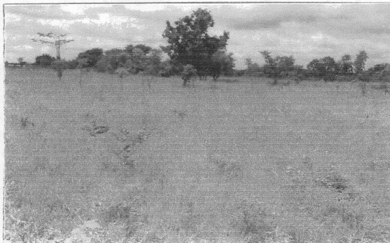
Plate 10: Deforestation is as a result of land clearing for Agricultural purpose this picture Shows a typical example, Land is left without vegetation cover, grasses are been burnt the soil will be bare and exposed to high run off and this will lead to erosion