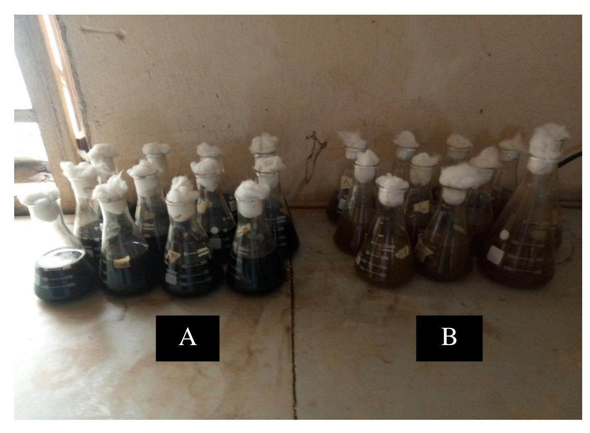
A= Watermelon/ Pineapple peels (substrate) B= Watermelon peels(substrate)