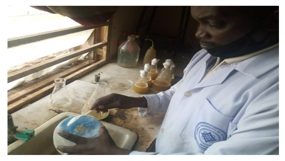
Filtration and Harvesting of Yeast cells