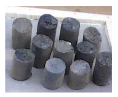
Plate II: Extruded Text pieces

30 test pieces were prepared from the sample collected from the three locations mapped out on the Dolomite deposit being investigated (Igbeti). Three test pieces were used to conduct each of the tests carried out on the sample.