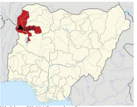
Fig1. [9] Map of Kebbi State

It is approximately 700 m above sea level. The plain landscape forms part of the vast Sokoto plains which is an end tertiary plantation surface. Is a repetitious lowland, sedimentary in origin, with average height of about 300 m above sea level. The plain surface is interrupted by isolated flat-topped lateritecapped hills and ridges. The riverine lowlands are mainly the flood plains of the major rivers which are very wide, up to 8 Km in many areas. They are characterized by levees, backswamos and terraces on the natural vegetation. And the fig 1 blow shows where Kebbi State is located on the map of Nigeria.