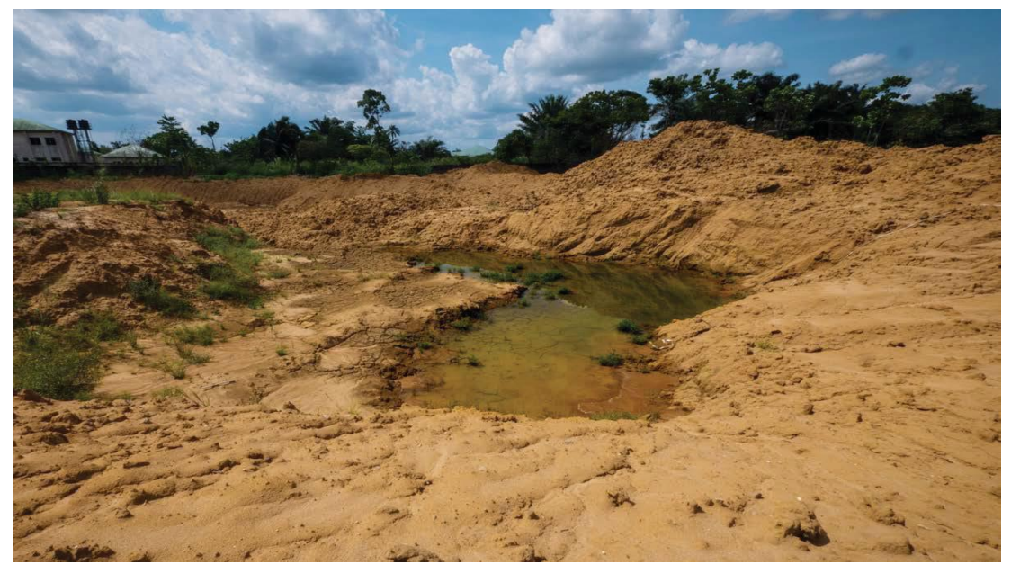
Figure 4: Indiscriminately disposed contaminant.