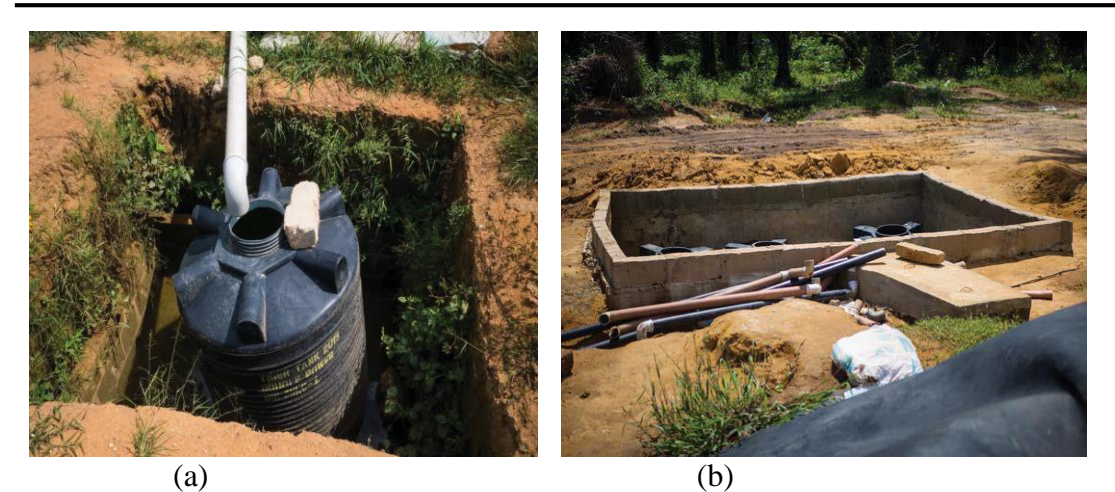
Figure 5: Poorly constructed and abandoned biocell drainage sumps.