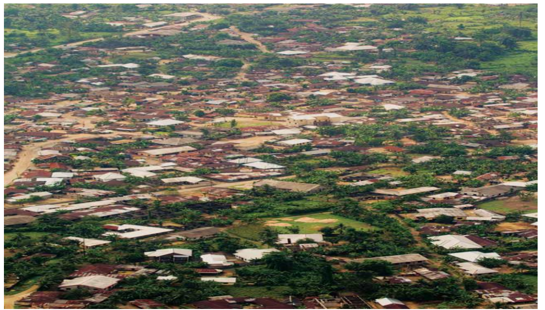
Figure 2: Roofs of houses in brown colouration as a result of Acid rain.

Gas flaring discharges hazardous particles into the atmosphere as it is a common practice within the entire Niger Delta (Buzcu-Guven and Harriss, 2012; Emam, 2016). This practice releases partially burnt or unburnt hydrocarbon substances into the atmosphere, causing serious air pollution with ensuing severe environmental and public health implications (Emam, 2016). burnt hydrocarbons Partially in the atmosphere mix up with rain, reducing pH of the water to 4.98-5.15 range thereby causing acid effect (Nwankwo and Ogagarue, 2011). of houses in Ogoniland Roofs are conspicuously seen in brown colouration as a result of corrosion caused by acid rain (Efe, 2010; Ejelonu et al., 2011). This makes roofs of houses to get old quickly as perforated and leaking house roofs are common occurrence within the Ogoni communities (Okhumode, 2017).