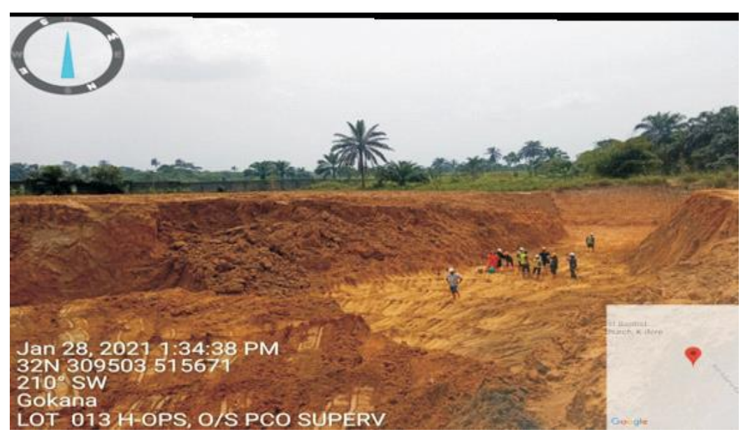
Figure 8: Excavated soil taken to treatment site.

The choice of excavation and evacuation to an offsite location; a quick remediation strategy, was adopted probably to minimize the risk of continuous movement of the contaminant into the subsoil if treatment is to be done in situ (Rosalie et al. , 2020) or to hasten the clean-up exercise following the aggravation of the environmental situation as the sites were abandoned during the Covid 19 lockdown.