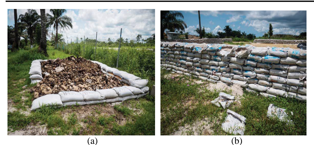
Figure 6: (a) Badly constructed and abandoned Biopile. (b) Incomplete Biopile construction with sandbags used as side walls seen already ripped off, compromising the strength of the biocell wall.

Poor planning and lack of commitment on the part of the Federal government and of course the oil company culminated in operational faults and failure. The Covid 19 pandemic lockdown of 2020 was on hand to provide an immediate excuse for workers on the site to completely abandon the remediation program. Hence, it has become very difficult to ascertain the effectiveness otherwise of the afore mentioned or remediation protocols being applied in the clean-up of crude oil polluted Ogoni environments (Amnesty International et al., 2020). For instance, the biocell and biopile systems which depend wholly on microbial actions on the pollutants operate on chance. The contractors do not know any of the microbial species involved in the hydrocarbon degradation, there was no