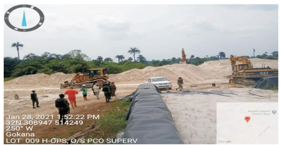
Figure 9: Treated soil ready for evacuation by the local sand dredger.