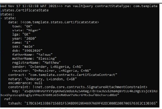
Figure 5: Ledger gets updated

Figure 5 shows the process of updating the ledger and creating a 64-bit unique hash to present an unchangeable birth certificate record.