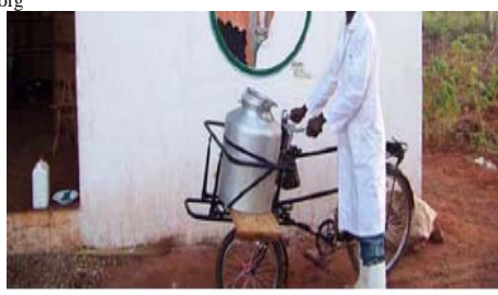
Fig 5: Milk, yogurt, and kiduruma are sold from distributed to the local community

Milk sales also started slowly. For Gorzo at the beginning, they had one restaurant in the urban area that bought milk. The restaurant and super markets were requesting more milk from day to day but with the cost of transportation and the small volume of milk transported, the profits were low. Each day, more farmers would bring milk. As milk intake increased, the individuals needed to find more customers. Fortunately, there was a good market right in the vicinity of the individuals, so they started selling back to the local community. Milk was sold from the association office and bicycle or motorbike routes were run-through the surrounding community. The associations also started making kiduruwa and yogurt to keep profits up. When there was a holiday period, the urban customer stopped taking milk. After that, the associations had sufficient local market for the amount of milk being collected, so they continued with local sales only.