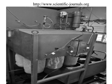
Fig 6: Schematic of another made icemaker