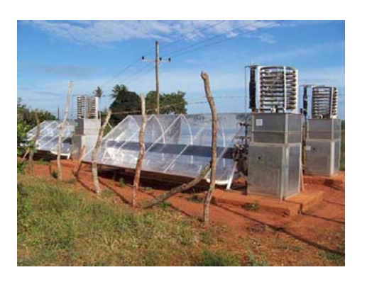
Fig 3: Three units were installed in Gwada District at Shiroro Dairy

The icemakers were transported to Northern part of the country and installed by trained technicians from the ministry and other men from the village. Installation is a very straight forward process of preparing the foundation, putting components in position, piping components together, installing the collector, and charging with refrigerant. Installation is an important part of training the operators. After the equipment was installed, the operators were trained how to operate the icemakers. They learned how to operate the equipment quickly by demonstrating operation a few times and then having them operate the machine themselves. For additional information, the physical processes occurring were described. After a few days, the assessment of the operators is that the equipment is "easy to operate." Considering everything, the installation and training went smoothly and the icemakers are performing well. The solar icemakers were making up to 60 kg of ice per sunny