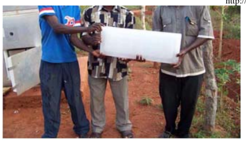
Fig 4: On a good solar day, the icemaker makes 12 blocks. Each block is 2 by 10 by 40inches, weighing 13.3 kg each.

For start-up, the spots must identify the specific customers for their milk. One option for the new spots was to sell their milk to the major dairy processors. The major processors pay about two thousand naira. The two new societies were planning to pay that amount to the farmers, so the societies and individuals itself would not be able to make money The retail price for milk is four thousand naira and more for the value added products of kiduruma or yogurt. If the societies / individual choose to retail milk, they would get the higher price, but then they would have the additional tasks and expenses of transportation, distribution, and selling. Also, there is competition in the urban milk market from the major spots and from numerous "close-in" farms that sell milk directly. Both of the newly created dairies decided on direct sales to get the retail price. There is strong demand for milk and the urban buyers are ready to help farmer groups as much as they can, so hopefully the societies and individuals would be able to market successfully.