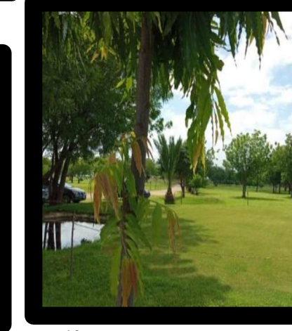
D: passive Sit-out