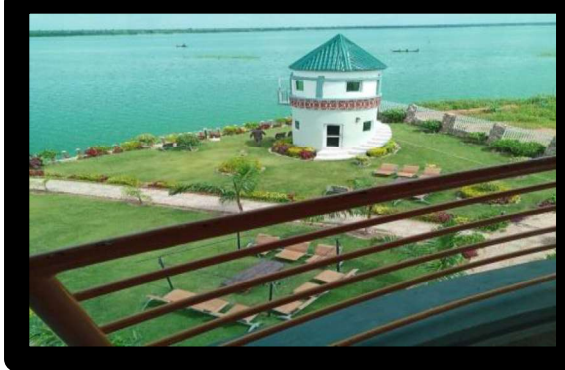
C: boat ride and gazebo