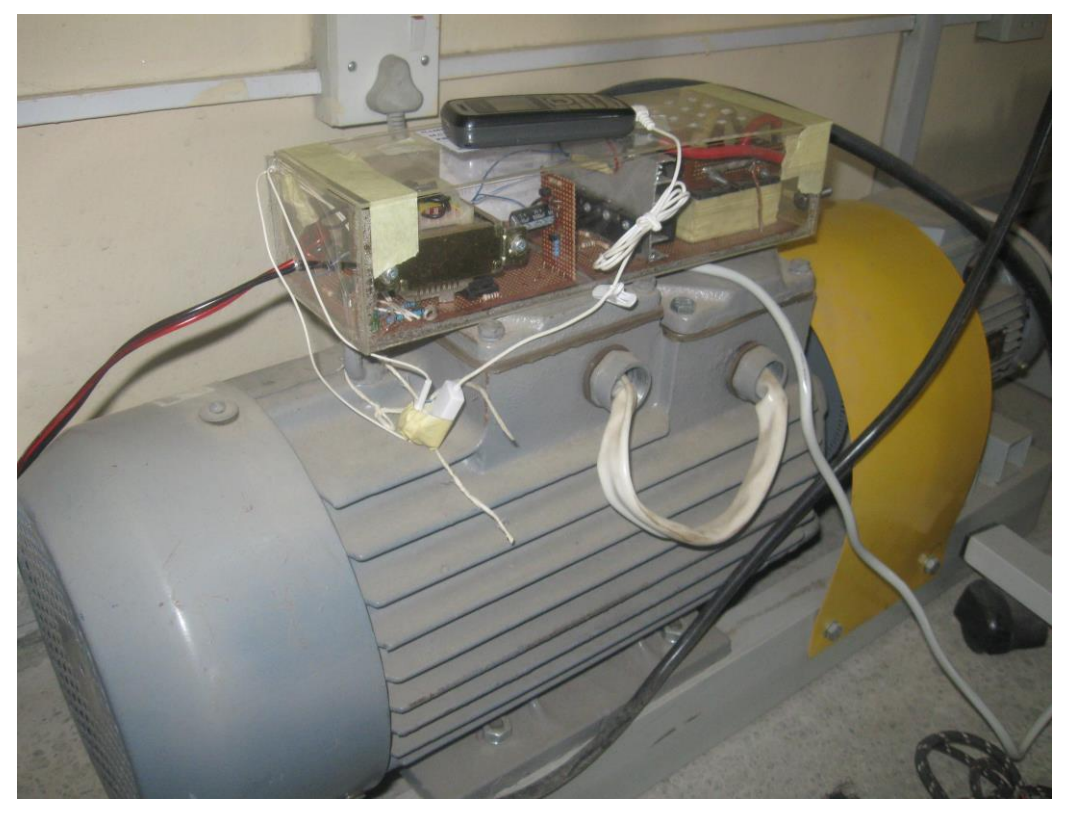
Fig. 1:The Control System with the Motor

The results obtained are discussed as follows.