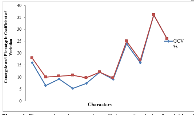
Figure 1: Phenotypic and genotypic coefficients of variation for yield and yield Components of nineteen accessions of sorghum evaluated 2015 and 2016 cropping seasons in Minna southern guinea of Nigeria