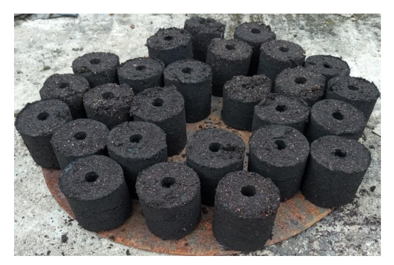
Figure 2.1: Briquette moulds

The briquettes were made from sawdust. The sawdust was carbonized in a heating device for hours. After carbonizing the carbonized sawdust was mixed with starch, and was mould by a pressing device into a circular hollow shape shown in Figure 2.1.