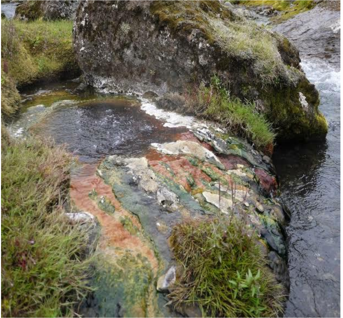
Figure 6: Hot spring microbial mat (Charlesworth and Burns, 2016)