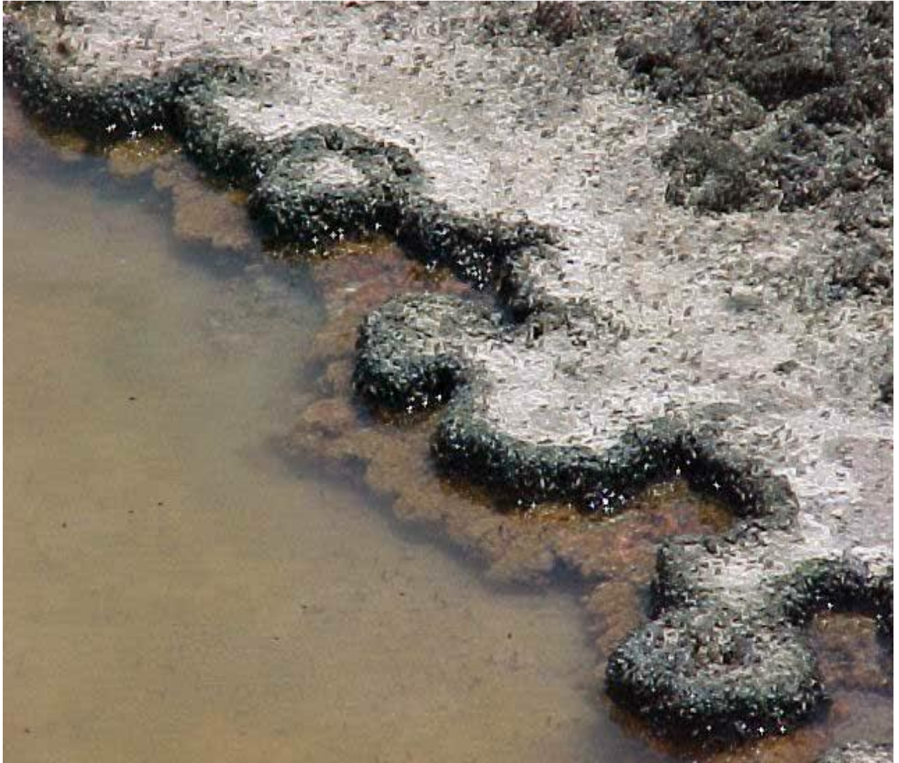
Figure 4: Hypersaline Mat