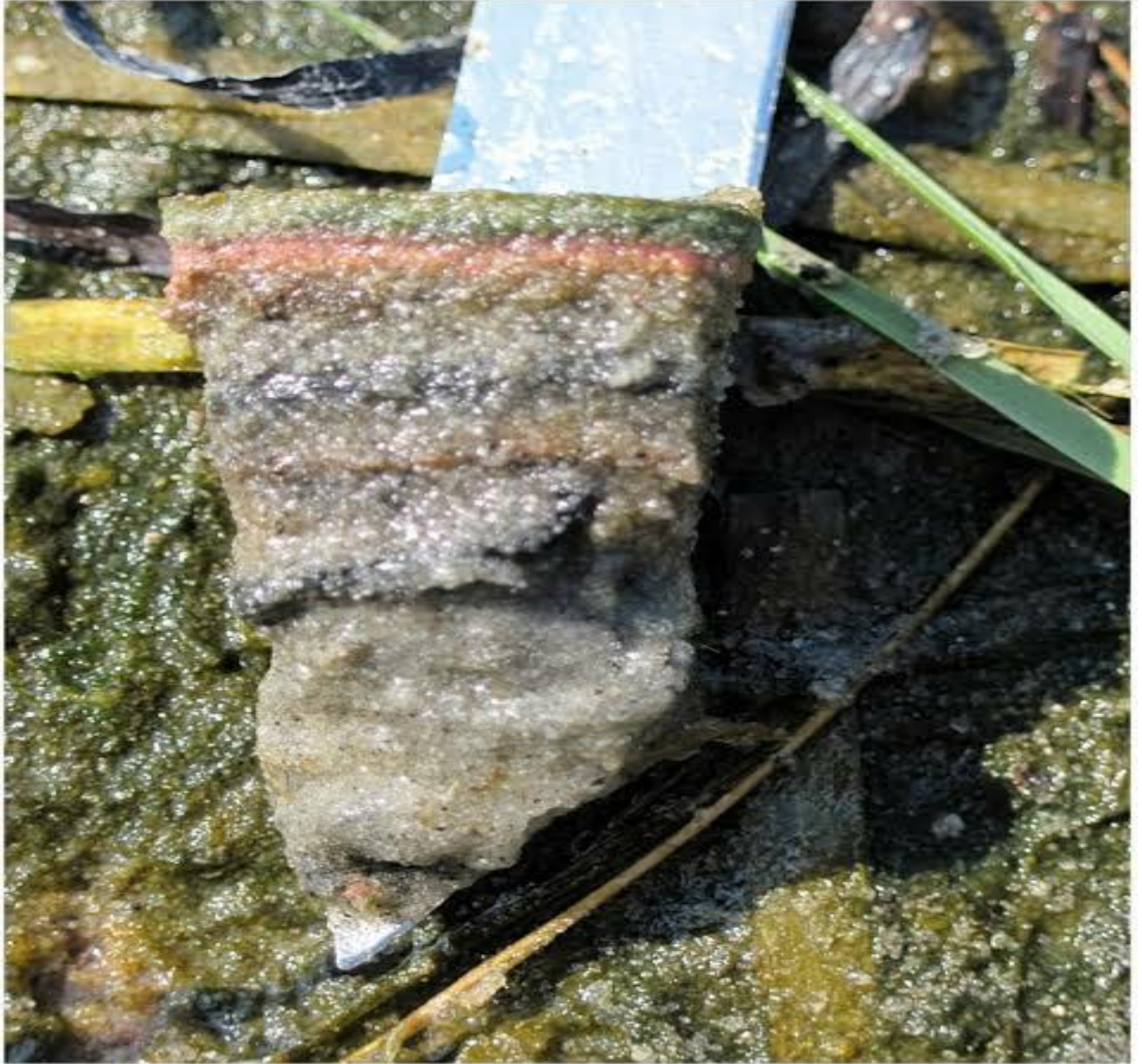
Figure 5: Psychrophile microbial mat (Nutman et al. , 2016)