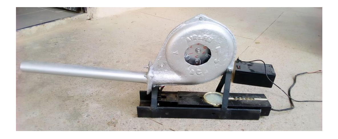
Plate 1: Picture of the Constructed Solar Powered Blower

3.0 RESULT AND DISCUSSIONS The picture of the constructed blower is presented in plate 1. Also, the results of the calculated parameters for both impeller and blower casing design are presented in Table I.