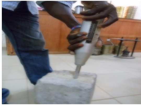
Figure 2 Testing using schmidt rebound hammer

The specimens were allowed to cool naturally to room temperature. Then, the Non-destructive test (NDT) and destructive test (DT) were conducted according to BS EN 12504 (2001), IS 13311 (1992) and BS 1881 (1990). Figures 1 and 2 show the NDT performed using Schmidt rebound hammer and UPV Machine, respectively.