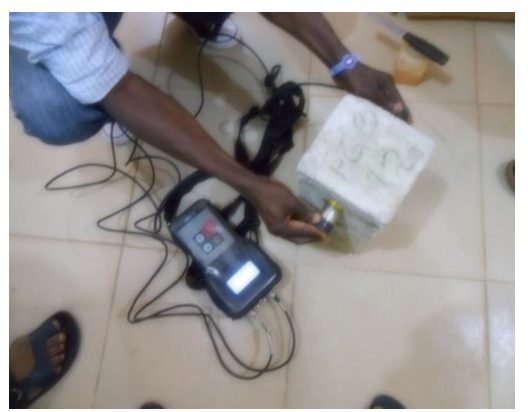
Figure 2 Testing using UPV machine