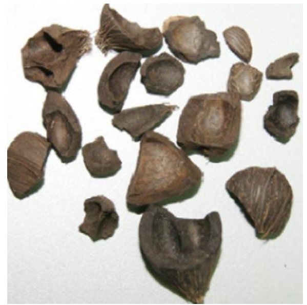
Figure 1: Palm kernel shell of various sizes

Palm kernel shell is waste obtained after the removal of the edible oil from palm fruit. There are two kinds of oil in palm nut; one is palm oil, which remain in outer core of the nut and the other is palm kernel oil which is extracted from the inner core, known as palm kernel. Palm kernel is covered by a hard endocarp called palm kernel shell and is alternatively known as oil palm shell. Figure 1 shows palm kernel shell in various sizes.