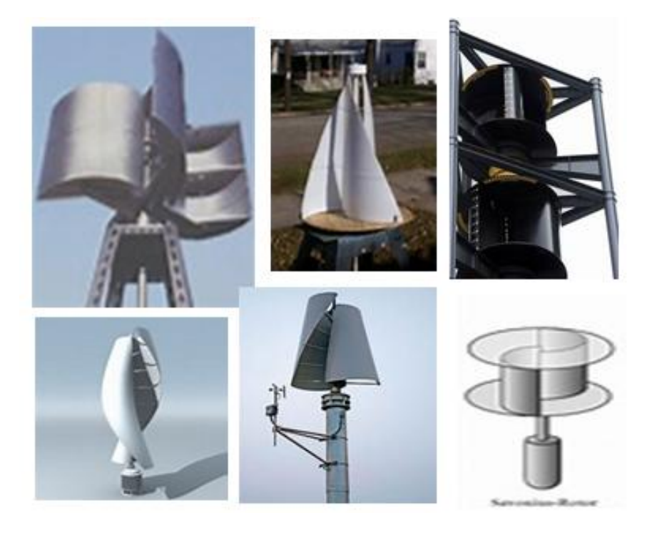
Fig. 2. Various designs of Savonius Vertical Axis Wind Turbine [18]

In an attempt to achieve high efficiency of the Savonius, modifications were made by adding a shroud to the rotor and this yielded an increase in the power coefficient [55,56].