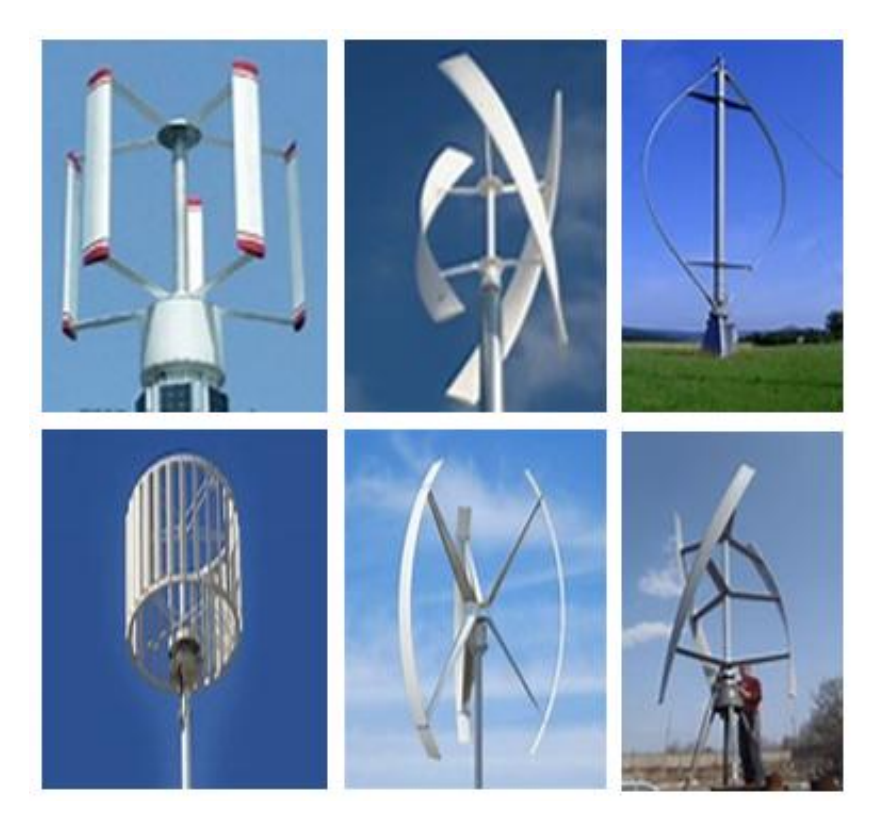
Fig. 3. Images of Darrieus Blade Vertical Axis Wind Turbine [63]

Musa et al. [69] constructed, field tested and compared "a standalone Darrieus VAWT and a standalone Savonous VAWT adaptable for the Usmanu Danfodio University community, Nigeria in terms of their revolution per minute under the same wind speed conditions. The results of this test showed that under the prevailing wind condition of the study area, the Savonius VAWT has a higher starting torque than the Darrieus VAWT but when the Darrieus blade starts it takes a longer time to stop, given its higher rotational speed reaching a maximum rotation per minute (RPM) of 93 and 89 to the Savonius at a wind speed of 9.28 ms<sup>-1</sup> and 8.9 ms<sup>-1</sup> respectively. It is therefore а general consensus among researchers that the combined system has a better performance coefficient than any of the individual turbines standing alone".