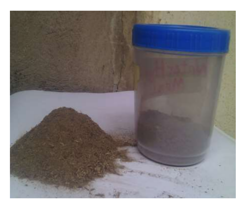
Plate 2: Water hyacinth meal on paper and stored in a plastic container with lid