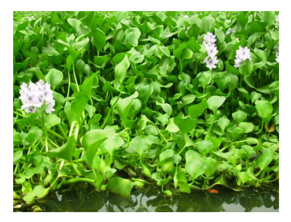
Plate 1: Water Hyacinth plants in full bloom

The problem of water hyacinth meal (WHM) utilization in the animal feed industry is its high fibre content (15-22 %). The fibre is made up of non-starch polysaccharides (NSPs) such as cellulose, hemicellulose, pectin and lignin. Added to that is the suspected presence of galactosides, phytates and other antinutritional factors (ANFs) such as lectins and tannins in water hyacinth meal, hence the need for the addition of exogenous enzymes for its proper utilization in livestock feeds. Addition of exogenous enzymes to fibrous feedstuffs have been known to help break down and release cell wall constituents present in the feedstuff before they reach the terminal end of the small intestine; hence