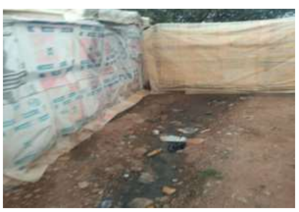
Plate II Drainage System at Kuchigoro Camp