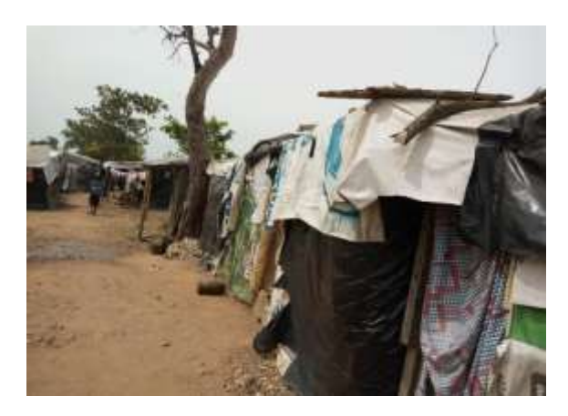
Plate I Shelter Condition at Kuchigoro Camp