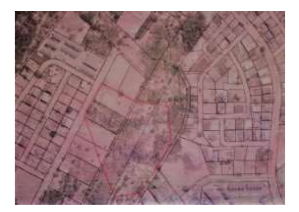
Figure 2: Map of FCT, Abuja