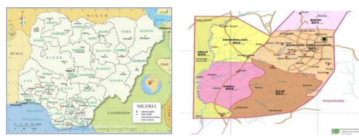
Figure 1: Map of Nigeria

The Federal Capital Territory is in the geographical centre of the nation with co- ordinates 9°4N 7°29E / 9.066667°N 7.483333°E respectively and occupies a total area of about 8000sq.km. It is bounded on the north by Kaduna state, on the west by Niger state, on the east and south-east by Nasarawa state and on the south-west by Kogi state. It falls within latitude 7 45' and 7 39'. FCT experiences two weather conditions in the year just like many other Nigeria states. These are the rainy season which begins around March and runs through October, the dry season (usually characterized by bright sunshine) which begins from October and ends in March. Within these periods, there is a brief period of harmattan occasioned by the northeast trade wind, with a resultant dusty haze and intense coldness and dryness. Nevertheless, the high altitude and undulating terrain of the FCT act as a modulating influence which makes the weather always clement.