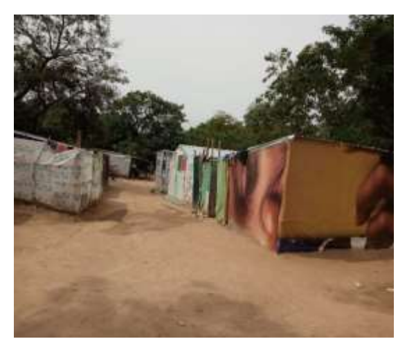
Plate V Shelter Condition at Durumi Camp