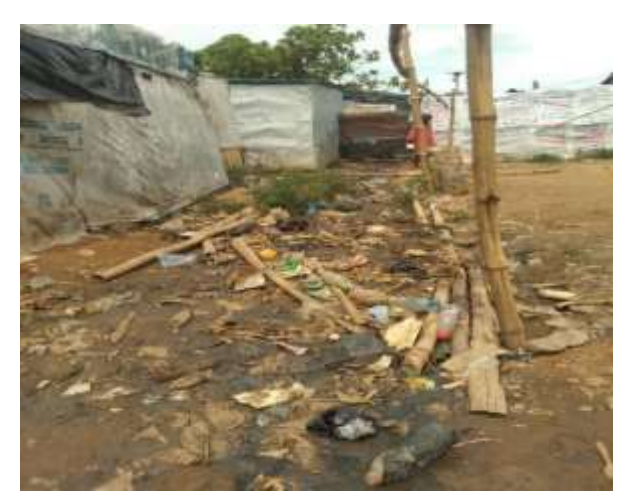
Plate VI: Environmental Quality at Durumi Camp