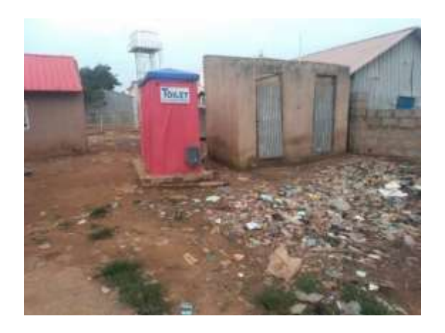
Plate III Toilet Facility at Kuchigoro Camp