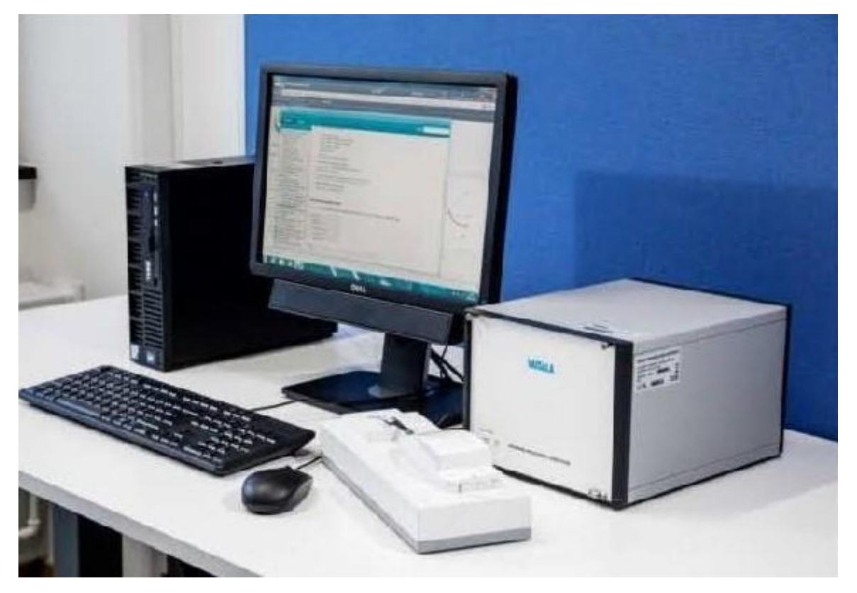
Figure 1: DigiCORA and Radiosonde sounding system from [7]

2034 (2021) 012029 doi:10.1088/1742-6596/2034/1/012029