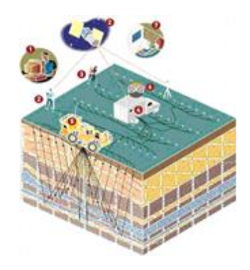
Fig. 2: Seismic exploration of gas and oil reservoirs on land.(Martin, 2012)

D. WSN for seismic exploration of oil and gas reservoirs: In (Martin, 2012), authors presented a WSN system effective for seismic exploration of Oil and gas reservoirs on land. Controlled seismic vibrations were generated at some points in the exploration area. Vibration Sensor nodes spread across the area were then used to capture the vibration signals reflected from the geologic structure and then seismic images of the geologic subsurface were constructed from the distributed measurements at the backend. The design employ ed Digital Signal Processing (DSP) techniques to obtain high resolution images using an algorithm to jointly estimate location and time parameters of the sensor nodes. Results of high efficiency were obtained through MATLAB simulations.(Martin, 2012)