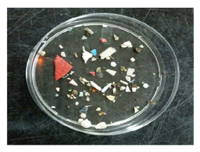
Fig. 2. Microplastics in different sizes and color from mangrove sediments in Peninsular Malaysia.