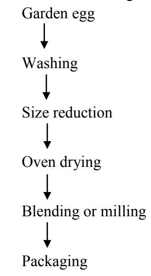
Figure 2: shows the Preparation flow chart of garden eggplant powder (Uthumporn et al. , (2015)

The eggplant flour were then kept and sealed in polypropylene plastic bag and subsequently in airtight container. The flour was then stored in refrigerator at 4°C prior to use.