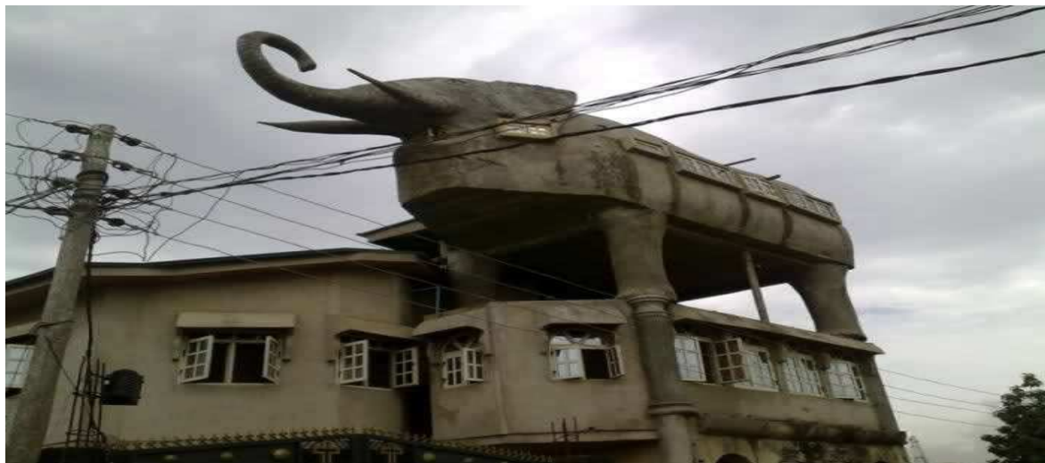
Fig. 3.3 Elephant house (Lagos State)