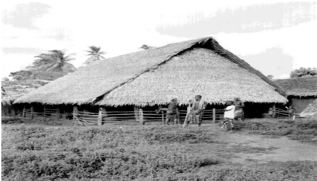
Fig. 3.2 Obu house Elu-Ohafia (Abia State)