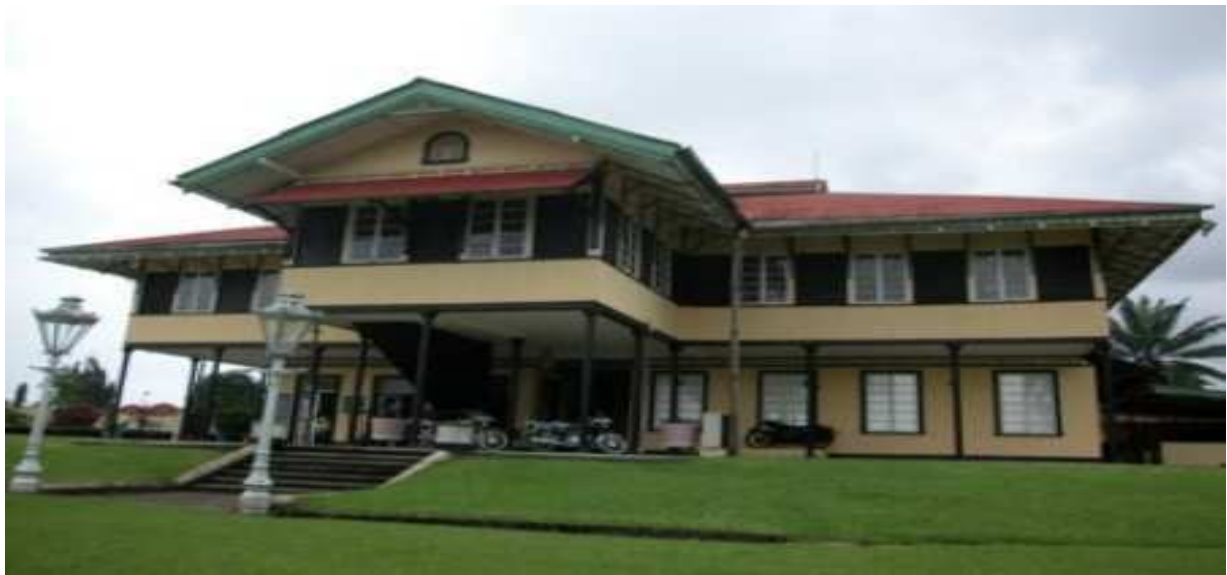
Fig. 3.1 Old residence Calabar (Cross-Rivers State)