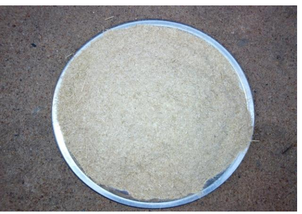
Plate 2: Crushed bamboo before impregnation