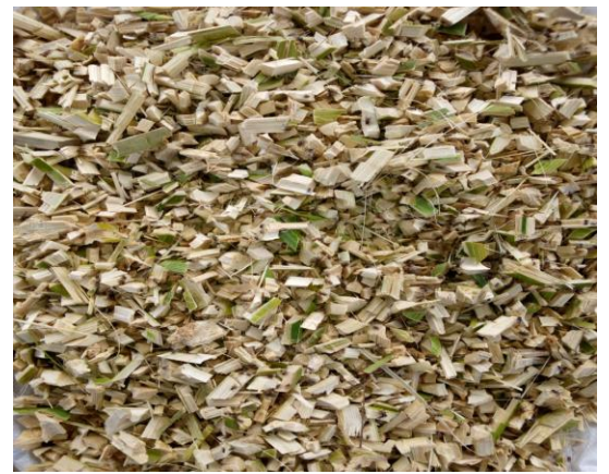
Plate 1: Pieces of Bamboo before carbonization

The bamboo was reduced to 0.25 mm diameter (Evbuomwan et al. , 2013) manually using cutlasses as shown in Plate 1. These bamboo pieces were washed with distil water to remove dirt and impurities. The washed bamboo pieces were dried in oven at 105 °C for 24 hrs to reduce the moisture content. The sample was later crushed to 0.180 mm via buhr mill. The weight of the total sample crushed was 100g. This sample was divided into two portions and accurately weighed 50 g each. The first sample was impregnated with 50 mL of sulphuric acid (H<sub>2</sub>SO<sub>4</sub>). The second sample was impregnated with 50 mL nitric acid (HNO<sub>3</sub>) for 24 hours until the mixed sample turned into paste (Nurulain, 2007). Each impregnated sample were washed with distilled water and then filtered. The residue remaining were collected and dried in at 105 °C for 2 hours as described by Ademiluyi et al. (2012) in the oven. Subsequenty, both impregnated samples were subjected to carbonization process at 450 °C in a muffle furnace as described by Ademiluyi et al. (2012). The carbonized samples were taken to the laboratory for characterization.