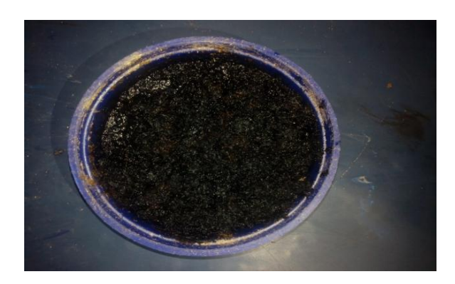
Plate 3: bamboo activated carbon impregnated with nitric acid (HNO<sub>3</sub>) Plate 4: bamboo activated carbon impregnated with H<sub>2</sub>SO<sub>4</sub>