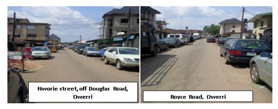
Figure 2 Street parking in Central Areas of Owerri Municipal

Several residents in the central part of the town do not have parking spaces for vehicles inside their compounds with most observed to be parking along the street as indicated in Figure 2. This affects the environment and health conditions of the area. However, the periphery areas have different situations due to the availability and provision of parking spaces in the residents' yards.