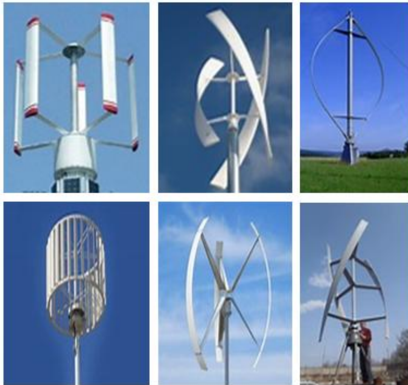
Fig. 3. Images of Darrieus Blade Vertical Axis Wind Turbine [63]

Musa et al. [69] constructed, field tested and compared “a standalone Darrieus VAWT and a standalone Savonius VAWT adaptable for the Usmanu Danfodio University community, Nigeria in terms of their revolution per minute under the same wind speed conditions. The results of this test showed that under the prevailing wind condition of the study area, the Savonius VAWT has a higher starting torque than the Darrieus VAWT but when the Darrieus blade starts it takes a longer time to stop, given its higher rotational speed reaching a maximum rotation per minute (RPM) of 93 and 89 to the Savonius at a wind speed of 9.28 \text{ ms}^{-1} and 8.9 \text{ ms}^{-1} respectively. It is therefore a general consensus among researchers that the combined system has a better performance coefficient than any of the individual turbines standing alone”.