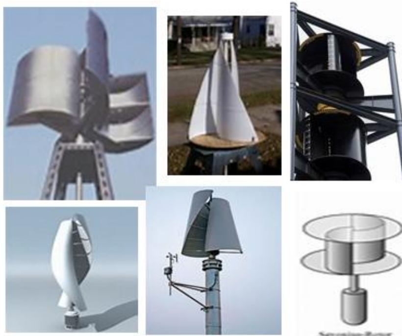
Fig. 2. Various designs of Savonius Vertical Axis Wind Turbine [18]

In an attempt to achieve high efficiency of the Savonius, modifications were made by adding a shroud to the rotor and this yielded an increase in the power coefficient [55,56].