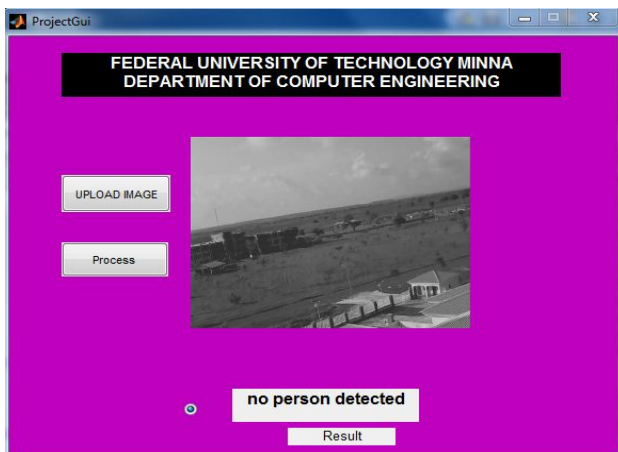
Fig. 4. When Non-Human is Detected

The result obtained from the classifier was evaluated using TP, FN, TN, and FP. True positive is the correctly classified human case of an image as human, while true negative is when non-human is classified as non-human. A false positive is when non-human is classified as human, while false negative is when human is classified as human. The accuracy, sensitivity, precision and specificity were computed using the TP, FN, TN and TP. Table 1, present the summary of the result.