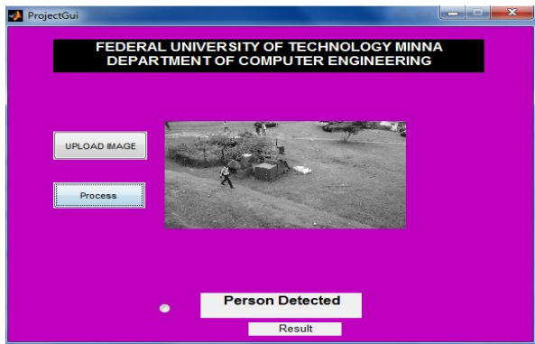
Fig. 3. When Human is Detected

In order to make the developed algorithm user friendly, a graphical user interface was developed using MATLAB. Fig. 3 and Fig.4 presents the graphical user interface of the developed algorithm when a human is detected and when no human is detected.