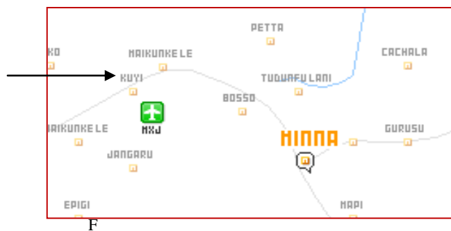
Fig. 1 Map showing Kuyi village in Minna

This research assessed a dump site soil as Kuyi village (Figure 1) in Minna, Niger state of Nigeria.