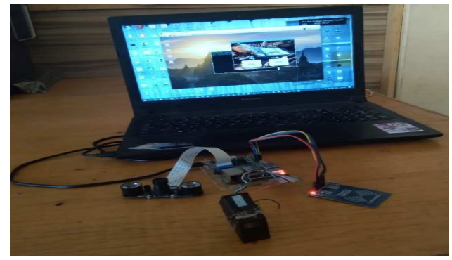
Fig. 3. The Developed Electronic Voting System

The conclusions of the research effort are presented and discussed in this section. The system accuracy and response time were determined, as well as the typical assessment metrics of the False Acceptance Rate (FAR) and False Rejection Rate (FRR). The method's machine reaction time and accuracy are also calculated, and the findings are presented in Tables 1 and 2. The Raspberry Pi 3B+, fingerprint sensor, iris recognition, RFID sensor and tag, and a laptop TTL USB module were chosen as the hardware components for the built system. Figure 3 depicts the developed electronic voting system.