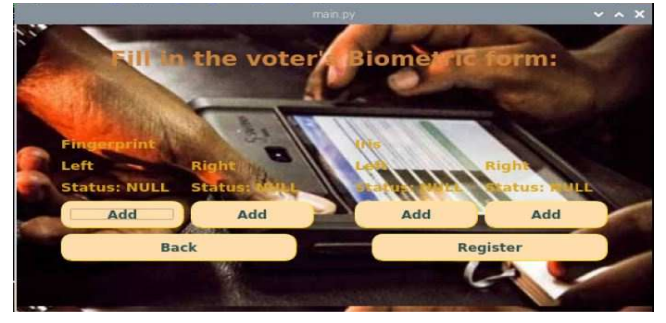
Fig. 4. Voter Biometric Page

down menu and cast their vote by pressing the vote button. The user is notified whenever a successful vote is cast.