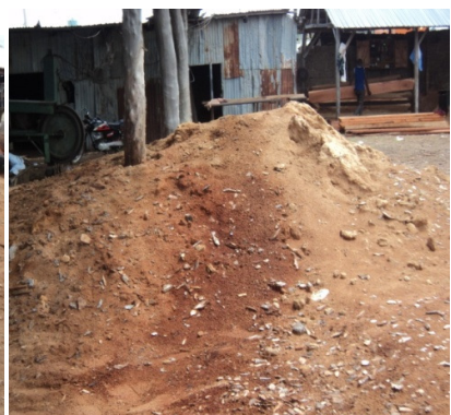
Plate 2: Indiscriminate saw mill waste dump