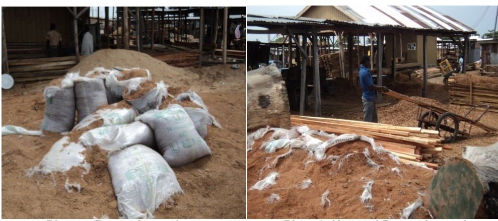
Plate 5: Bagged saw dust