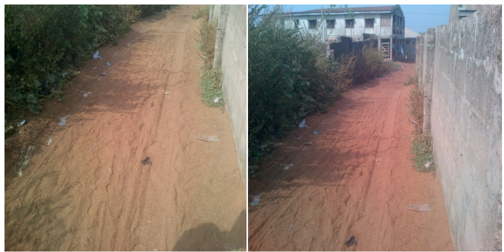
Plate 7: Road Fill