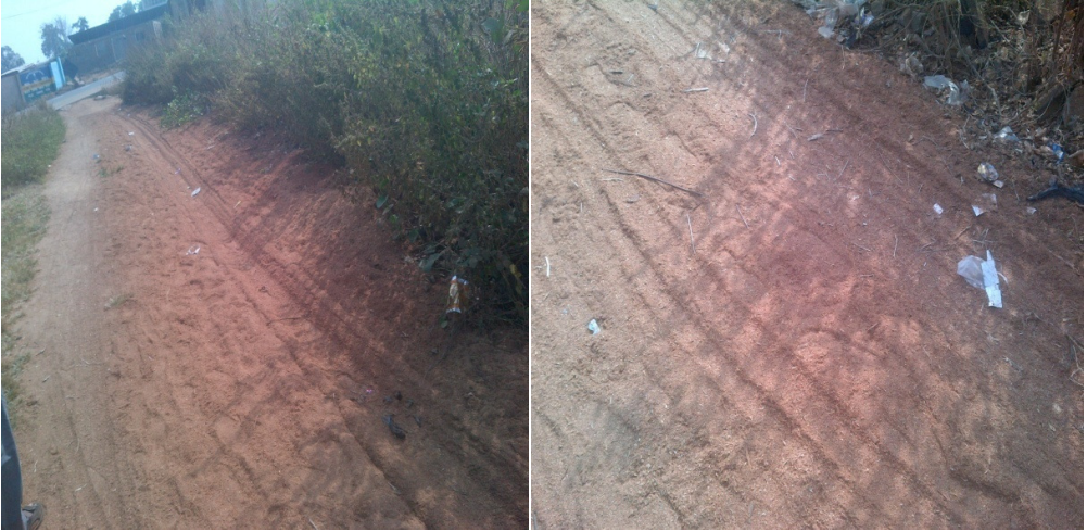
Plate 9: Road Fill