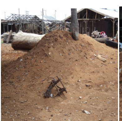
Plate 1: Heap of saw dust