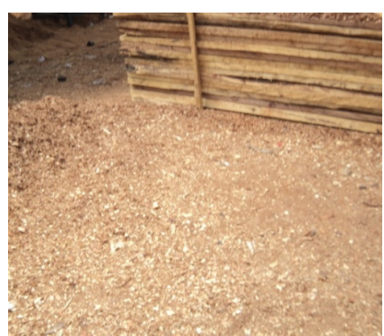
Plate 4: Face of a typical Timber shed