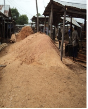
Plate 3: Face of a sawmill