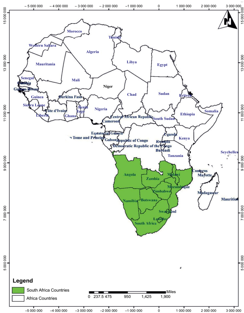
Fig. 1. Countries of Southern African sub-region