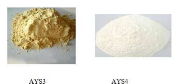
Plate 1. Visual presentation of aerial yam starch flours using different extraction solvents. AYS1 = with water, AYS2 = Aerial yam starch extracted Aerial yam starch extracted with sodium hydroxide (NaOH), AYS3 = Aerial yam starch extracted with amonium oxalates, AYS4 = Aerial yam starch extracted with oxalic acid.

ability as a reducing agent, while the starch sample treated with water, sodium hydroxide and ammonium oxalate gave a less appealing sight (Plate 1) probably because of the less effect on enzymatic browning. These visual colour differences could restrict the use of the starch samples in products where the colour changes are not desired.