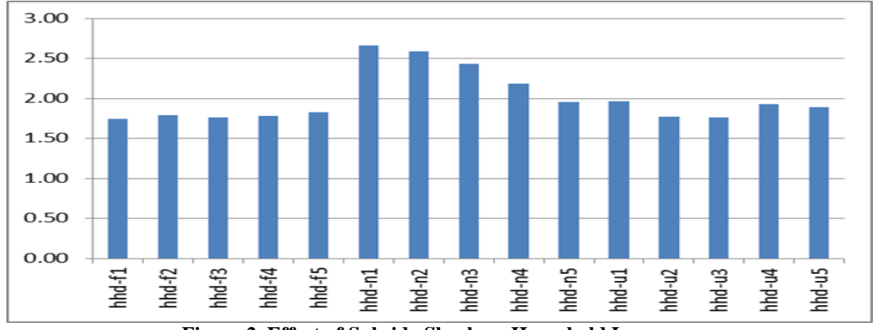
Figure 2. Effect of Subsidy Shock on Household Incomes