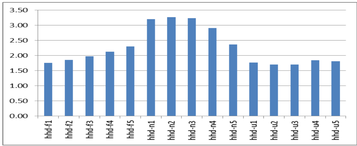
Figure 3. Effect of Government Expenditure Shock on Household Incomes

Figure 3 reveals that government spending shock impacted on all categories of households within the economy, particularly, households within the first, second and third quintiles non-farm households by 3.1%, 3.0% and 2.9% respectively. Impact ranged from 1.7% for the urban household to 3.26% under the rural non-farming households within the second quintile.