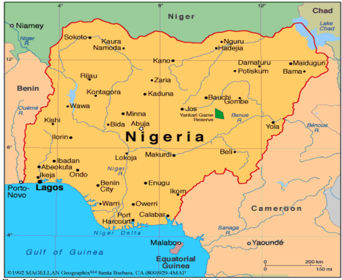
Figure 2: Map of Nigeria (http://www.infoplease.com/atlas/country/nigeria.html)