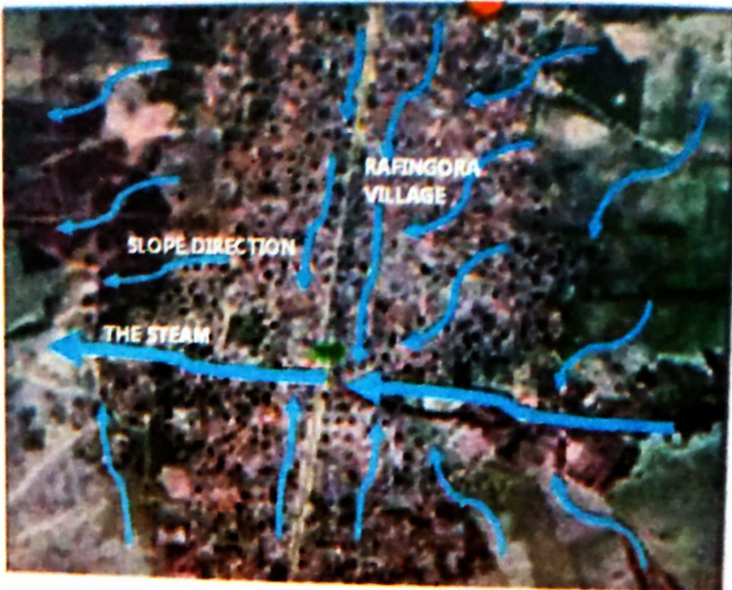
Figure 2. slope analysis of Rafingora village.