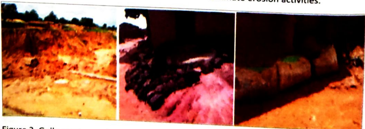
Figure 3. Gully erosion and sandstone used as foundation embankments in Rafingora.

The inhabitant of Rafingora majorly lives in mud houses. The physical examination and oral interview of the people revealed that the walling materials of their buildings were excavated from the major stream valley within the village. In other scenario, sand stone were also excavated from the stream valley to buttress their building foundations to mitigating the impact of gully erosion as revealed in Fig. 3. The only consolidated sand stone available in the area is been excavated by the villagers and this has made the entire area more vulnerable to gully erosion. The farming system is dictated by the short duration of the raining season of about three months effectively. Amidst of this, the villagers still depend on fuel-wood for their domestic energy supply. Apart from mango trees and other trees like lime, the entire area is covered with patches of grasses. There is therefore no cover crop after rain-fed harvest to checkmate erosion activities.