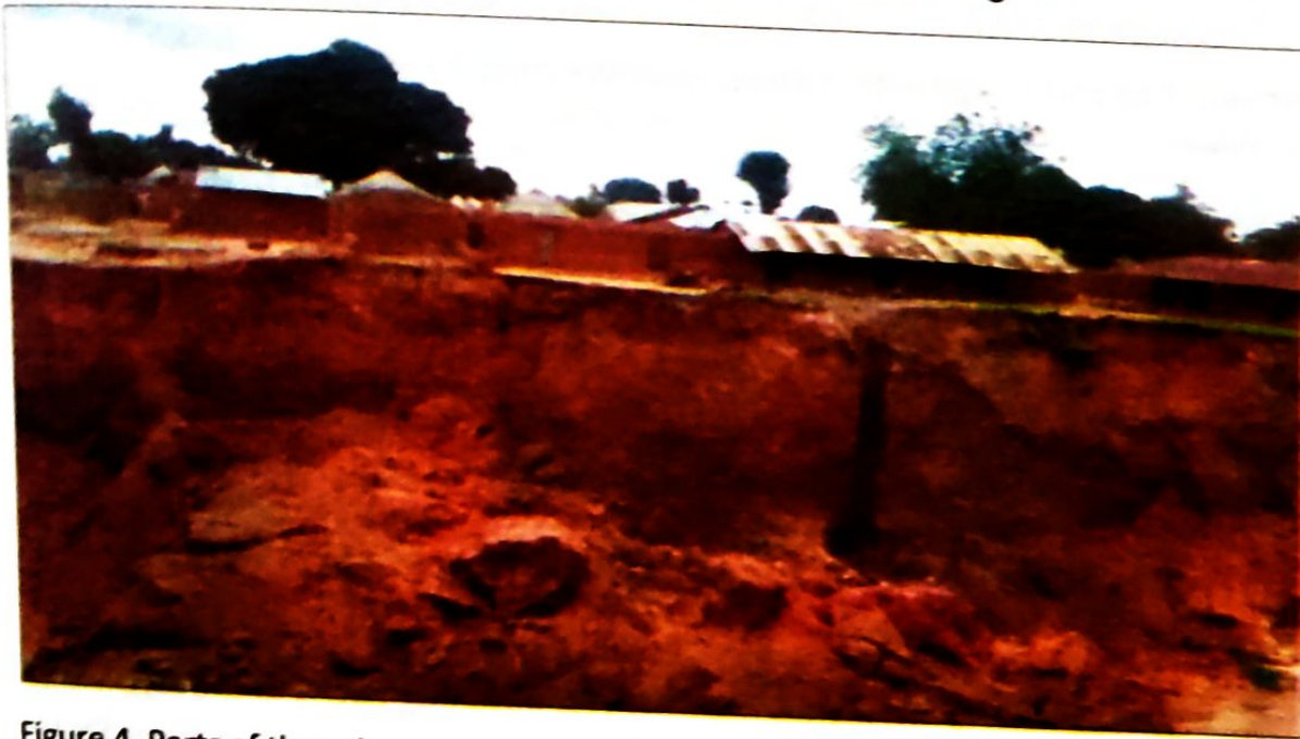
Figure 4. Parts of those houses that are more vulnerable to severe gully erosion.

One of the major challenges in the built environment where gully erosion is prevalent is landslide and soil creep that often threaten housing structures and other infrastructural facilities. The sporadic expansion of the major stream valley in the village has claimed lives and buildings, and still continues to threaten the livability of the existing ones. More than forty (40) houses are less than one meter (1m) away from the brim of the stream gully. Although, within the community there are areas with less severity of erosion, but the eastern part of the village where land sliding is more active, all houses situated close to the erosion channels are highly vulnerable as revealed in Fig. 4.