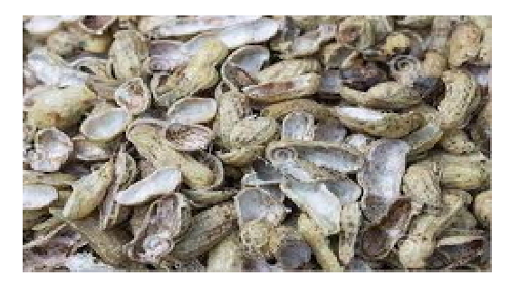
Plate 1: Groundnut shell

The agricultural residues used in this research are groundnut shells (Plate 1) and rice husk (Plate 2) obtained as residues from the processing sites at Sabon Tasha and Yarimaram areas respectively in Potiskum Local Government Area of Yobe State. These residues were chosen based on their abundance and availability as agricultural residues that became nuisance to the environment. The residues were milled separately and sieved using a 2 mm sieve to take out the oversized particles. A gum Arabic (Plate 3) bought from Maiduguri Monday market in Borno State was dissolved in water, stirred properly to form a gel (Plate 4) and was used as a binder.