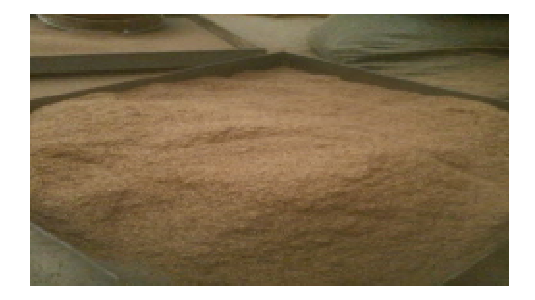
Plate 2: Rice husk