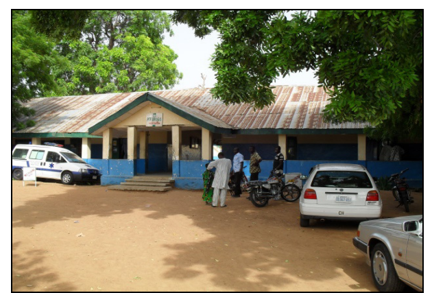
Plate I: General Hospital in Tungan Magajiya