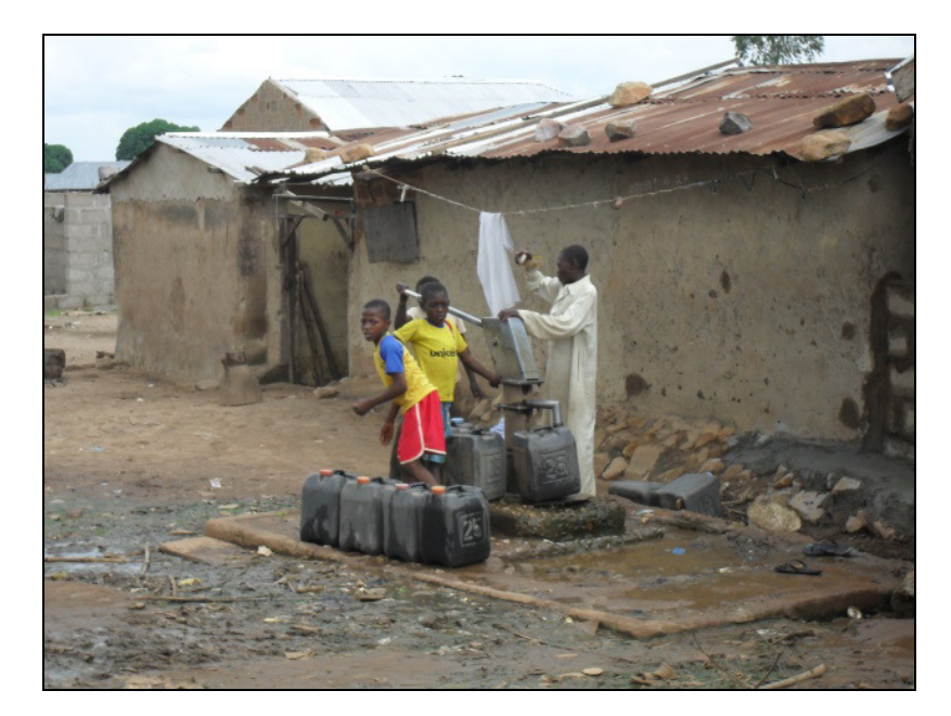
Plate III: Public Borehole in Bangi