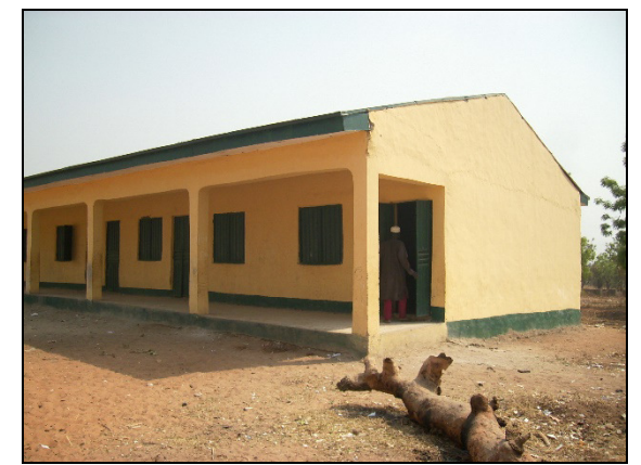
Plate II: A new primary school structure at Kitiriko