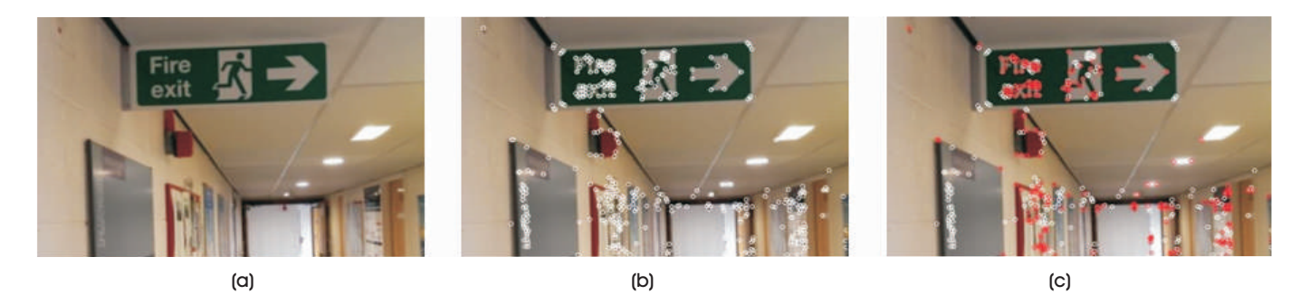
Figure 1. (a) Original Image showing an Exit Sign along a Corridor of the Kilburn Building of the University of Manchester (b) Keypoints Detected using FAST Detector. The White Circles indicate keypoints that also include other Interest Points such as Edges (c) In this Image, the Red Circles show the Strongest Corner returned after applying a Corner Response Function to the Detected feature from AST

The repeatability test obtained for all detectors (BRISK, ORB, SIFT, UFAH, and USURF) on a dataset of images