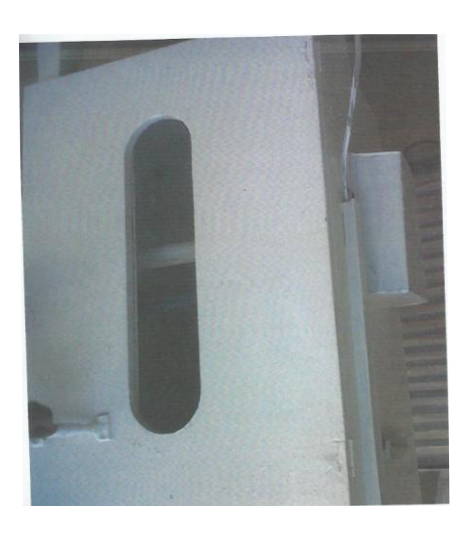
Fig3: The Constructed Egg Incubator