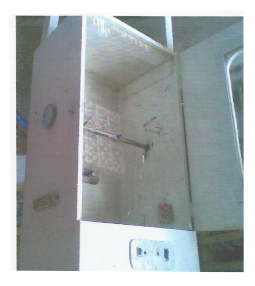
Fig 4: Interior view of Egg Incubator