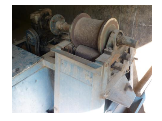
Fig. 1. Roller Juice expeller

A 15 hp electric motor or 16 hp diesel engines depending on location supplies power to the rollers through belts, pulleys and gears to actuate the movement of the rollers at 60 rpm for the top roller and 70 rpm for the lower set of