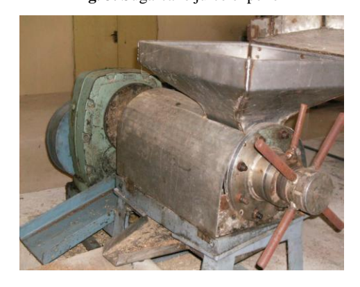
Fig. 3. Sugarcane juice expeller

Comparison of performance between the roller cane juice extraction and cane cutter/juice expeller