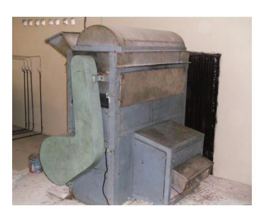
Fig. 2. Sugarcane cutter

About 3-4 canes are thrown into the hopper of the cane cutter which is cut into fragments of about 3-7 mm sizes. These fragments pass through the sieve on to the grasshopper conveyor by gravity as they are brushed against the sieve by the rotating knives. They are then transported by and fed into the expeller through the hopper. The rotating worm of the expeller conveys the cane fragments and subjects them to compressive forces as they