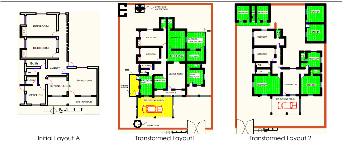
Figure 2 Illustration of a two roomed apartment with two samples of user initiated transformation.