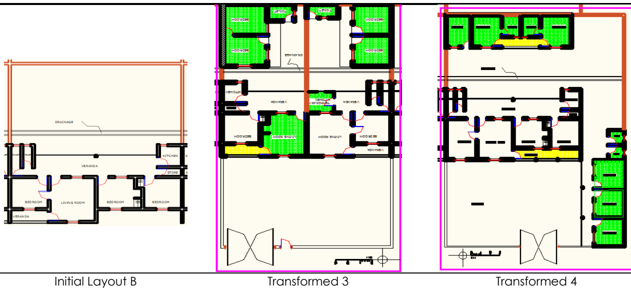
Figure 3 Illustration of a three roomed apartment with two samples of user initiated transformation.