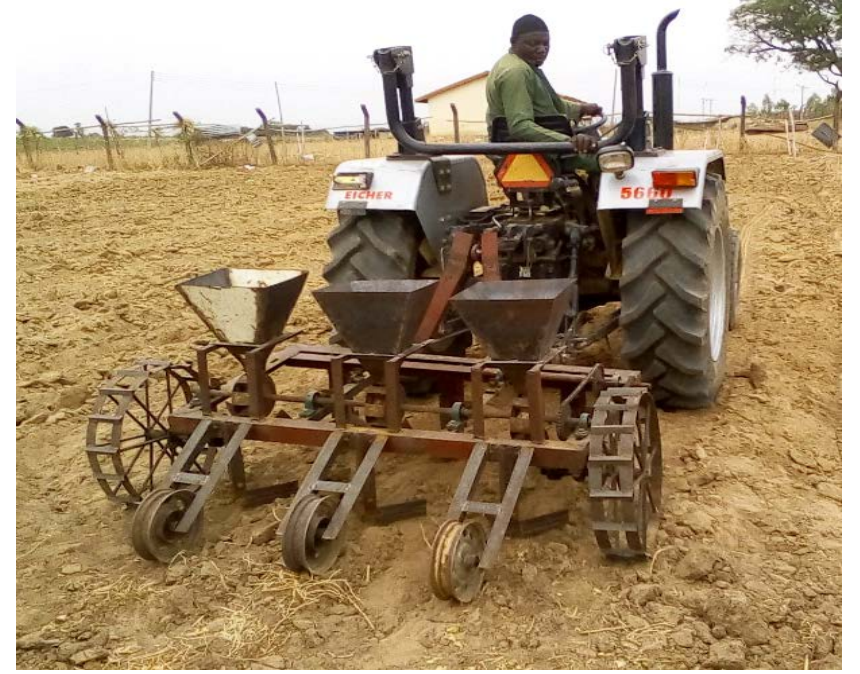
Plate 1: The fabricated seed planter