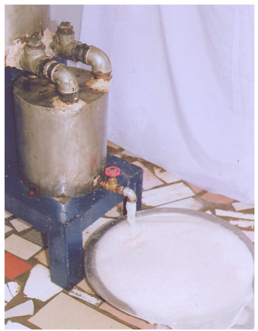
Figure 1.Fabricated Grains Drink Processing Figure 2.Soy Milk during Processing Machine in