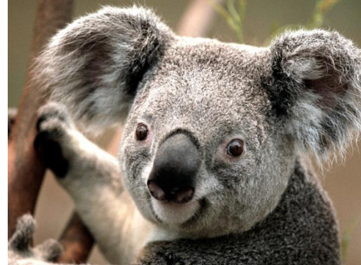
Figure4.1: Cover image