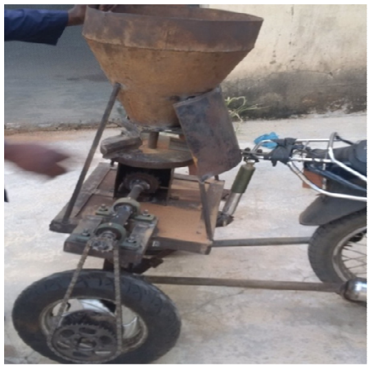
Figure 3: The developed equipment