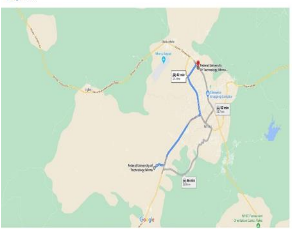
Table 3: The Google Road Map of Gidan Kwano-Kpakungu-Bosso Pavement