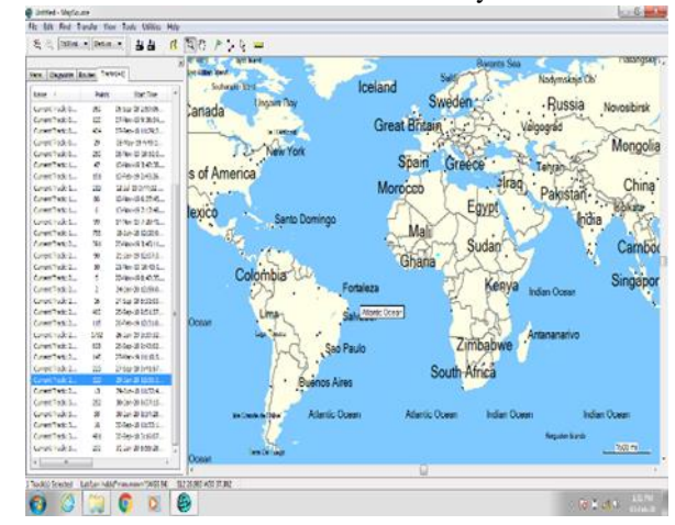
Figure 1: The Map Source Interface of GPS Data of Gidan Kwano-Kpakungu-Bosso pavement

While figure 3 shows the road map of Gidan Kwano-Kpakungu-Bosso pavement and average time taken to navigate two campuses from google map and this time serves as a reference to determine the time difference of the vehicles in consideration for the study.